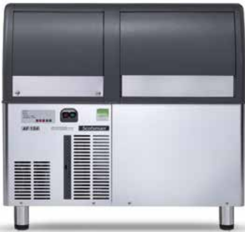
Flake ice residual water content 25%