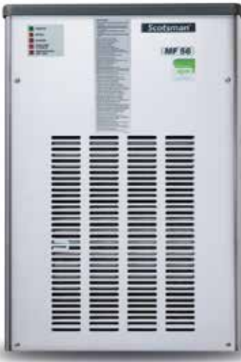
Superflake ice residual water content 15%