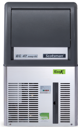
Medium gourmet cube 20g, 30mm dia x H 34mm

ECM 47 AS OX Medium gourmet cube 20g, Ø30mm x 34mm