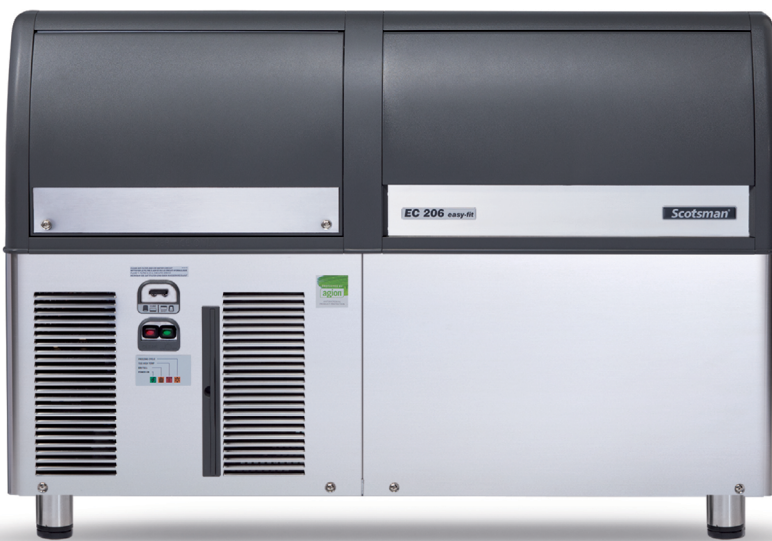
Small gourmet cube 8g, 21mm dia x H 25mm