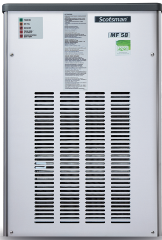
Nugget ice 1g – Ø 11mm x H 13mm